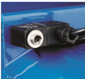
Soft Start Valve

And, uniquely on this size of compressor, the Duplex units are fitted with a sequential start system which enables these 3.0Hp and 4.0Hp systems to run off a 20 amp single phase power source reducing installation costs and start up load.