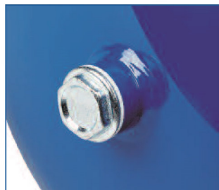
Internally Coated Receiver